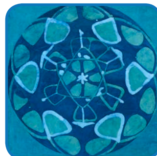
Heated Exchange: Contemporary Encaustic Jan 25 to March 14, 2017