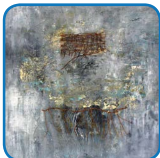
Peeling Back: September 14 to October 5, 2016.