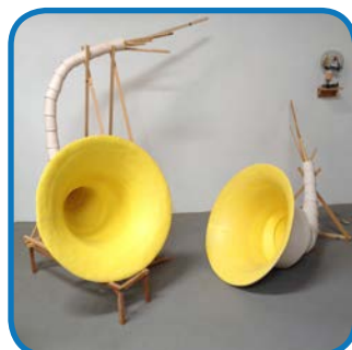
Altered Objects: October 24 to December 12, 2016.