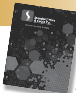
Tiffany Gosden Standard Wire-Cable Cover

Also in Art 446 Design Practices II spring 2006, Tiffany Gosden's design was selected for the