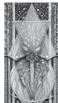
Gilah Yelin Hirsch Kingdom (Mayim/Shamayim), 2005 Acrylic on canvas

Kommepcahtb Weekend (Kiev, Ukraine): "Kocmorpadbnr" Lnnbi Ennh Xnpuu b Ranepee, (Continued on page 4)