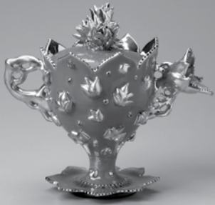
Takayama Ogawa Two Lips Mania From the exhibit: Teapots: Object to Subject