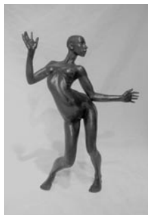
Vladimir Goryachev Twisted, 2005 Bronze From the exhibit: The World through Their Eyes: New Work by Art Department Faculty

An exhibition featuring sixty-five works of art in varied media by twelve Art Department faculty members. Included in the exhibit will be the artists