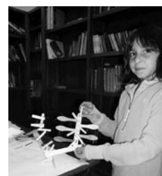
Construction/Contraction project; Carson Boys and Girls Club, Shoebox Sculpture K-12 Art Workshop, 2007 Presented by the City of Carson Fine Arts and Historical Commission